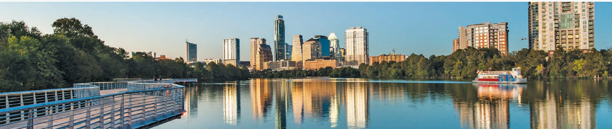
Boardwalk on Lady Bird Lake by Limbacher & Godfrey Architects

AIA Austin is the voice for our region's architecture community. We advocate for our members, the profession, career development, and design excellence. We influence public opinion and policies that shape our built and natural environment.